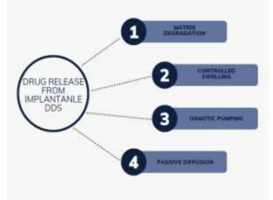
Fig. Drug release from implantable DDS

Osmotic pumping and passive diffusion, has been the best in conveying drug in a direct cycle, where's the medication measurement delivered is corresponding to square base of the delivery time. Swelling control, dissolvable entrance into the grid of the medication gadget is typically a lot more slow than dispersion of the medications, which then, at that point, brings about a brought down discharge rate. Osmotic standard can give a consistent delivery rate. The discharge energy of medications from frameworks intervened by osmotic strain, enlarging, and detached dissemination rely upon the dissolvability and dispersion coefficient of the drug in the polymer, the medication load and the in vivo debasement pace of a polymer.